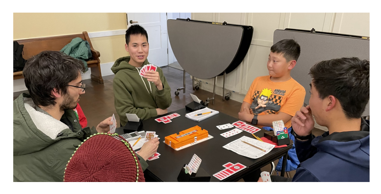
December 18, 2023 - Two CBE teams vie for first place in the final round of the QuickTricks team game

In addition to our weekly Saturday Street Taco event, we encourage the kids to compete on the last Monday of each month at the premier face-to-face bridge club in town, QuickTricks, which holds weekly games in the Castro (100 Diamond St.). We've always encouraged our kids to play in the "last Monday" Quicktricks team games to get more exposure to topnotch competition. In the beginning our kids hoped to place at a respectable position. Now the kids expect to win every time they enter. In December 2023 CBE fielded two teams, each a mix of kids and mentors, that won every match prior to meeting in the final match. The final round ended in a draw; a fitting end that left both teams undefeated.