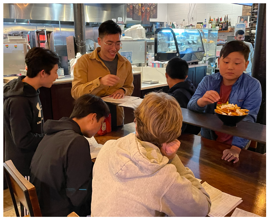
Gyro Express, our go-to spot after QuickTricks