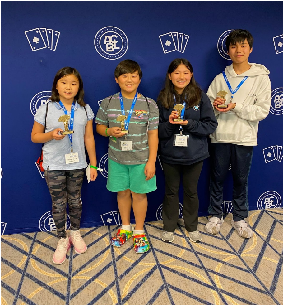
Thursday afternoon Youth Swiss, 2nd overall:

We're very proud of all our CBE juniors for representing us so well in Chicago, at and away from the table! The ACBL even noticed our CBE contingent and wrote a small piece about us in the daily bulletin (See https://cdn.acbl.org/nabc/2023/02/bulletins/db9.pdf )