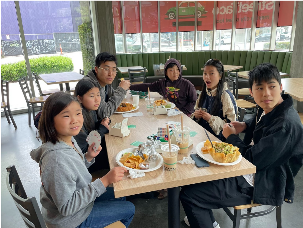
Taco 'bout some tasty bridge!

The kids can ask for help during the hands and we teach card techniques and bidding conventions as they come up. Players of all ages and skill levels are welcome with this teach-as-we-go style. Most importantly, the kids can talk and joke around as they play. Remember, the most important thing we teach is that bridge is fun!