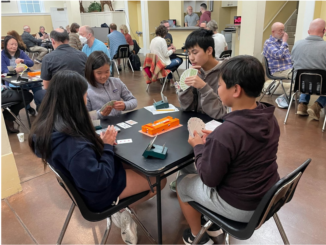
Kids do battle at the QuickTricks 499er Pairs Game