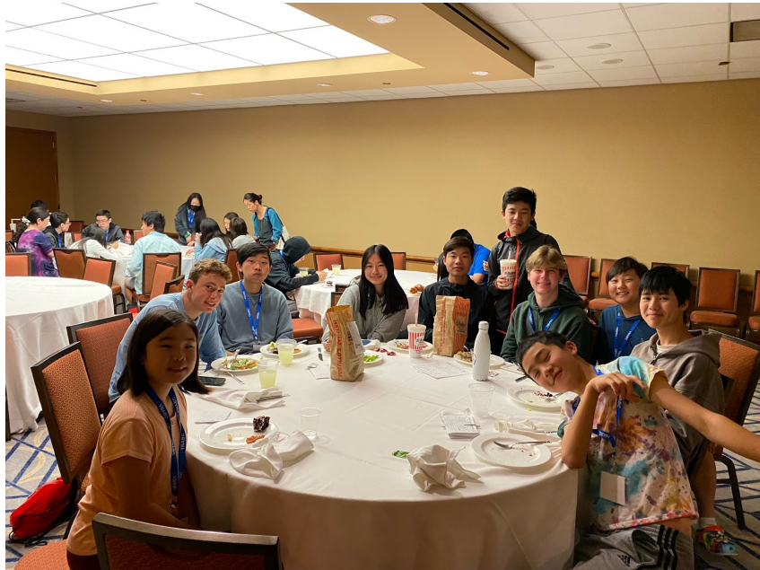
Lunch time between sessions at the Youth NABC