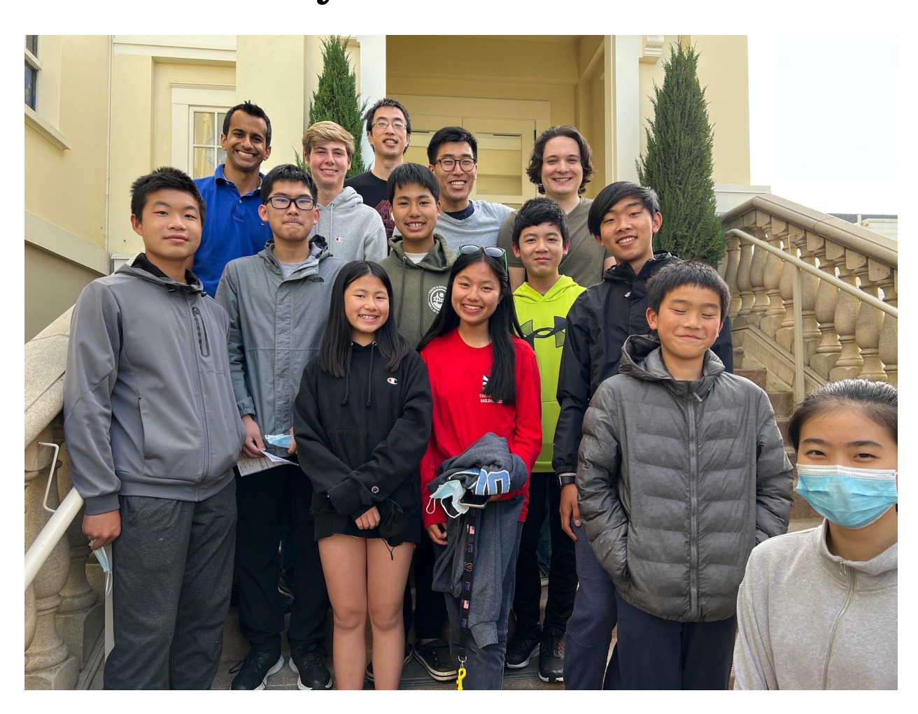
The CBE kids gather outside the steps of Most Holy Redeemer church before QuickTricks.

In preparation for the youth NABC in Providence, CBE ran a summer junior program where we invited local juniors, Providence bound or not, to play with CBE mentors and each other at QuickTricks club games. We saw huge success, bringing ten or more kids each weekly session to play with the many mentors that came to support the kids.